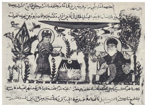
This miniature in an Arabic manuscript of the early 13th century depicts the preparation of drugs. A liquid remedy is being mixed over a fire in the open air, where flora and fauna symbolize the pharmaceutical bounty of nature. The bearded figure (right) holds out an ornate ceramic drug container. This manuscript was based on Galen's treatise concerning electuaries.