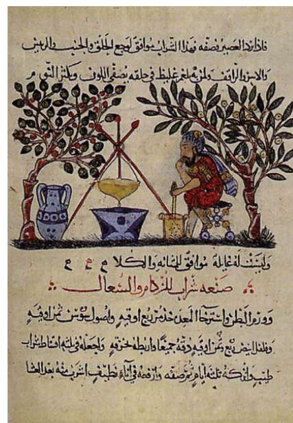
The preparation of an aromatic wine to treat coughs; from an Arabic translation of Treatise on Medicine by Dioscorides. (Metropolitan Museum of Art, New York).