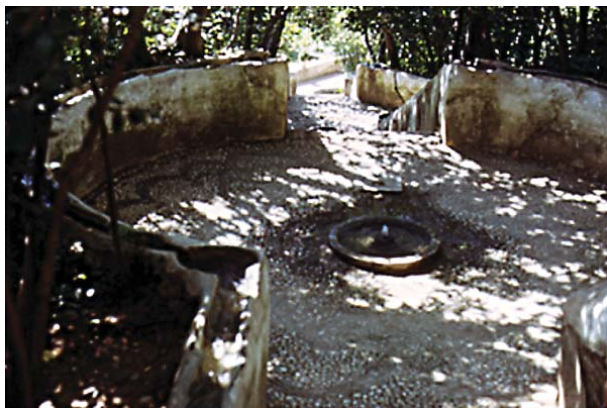
Generalife water banisters, Granada (1972).