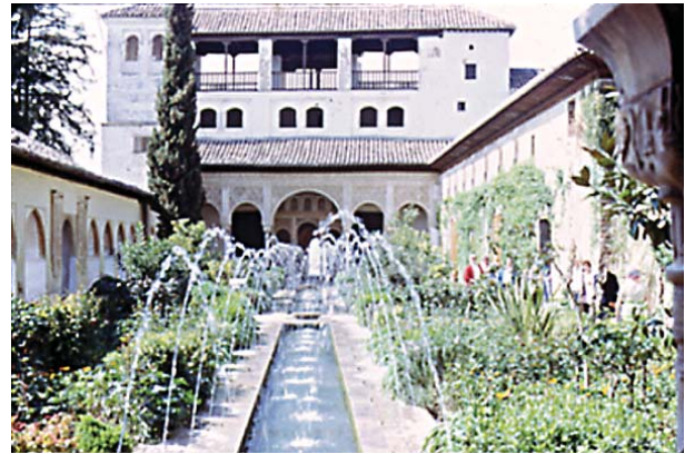
El Generalife, Granada (1972).