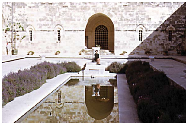
Rockefeller Museum, Jerusalem.