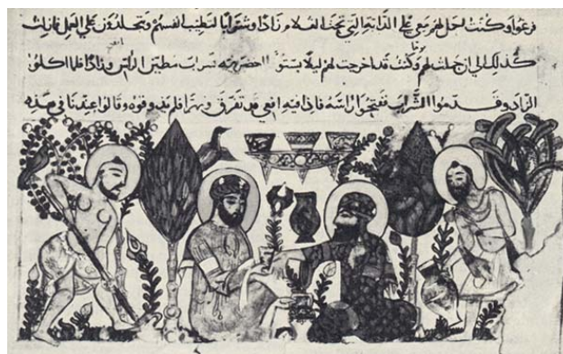
This companion to the illustration on the left shows the preparation of theriac, a complex antidote that Galen's recommendation helped to raise to the level of an internationally renowned panacea. Between and above the two central figures are various drug containers from which they are measuring the ingredients. Two assistants (extreme left and right) obtain supplies of crude drugs for the compounders. (Miniature from ms. in Austrian National Library, Vienna; reproduced from Zekert, O.: Chem. and Druggist 120:728, 1934).