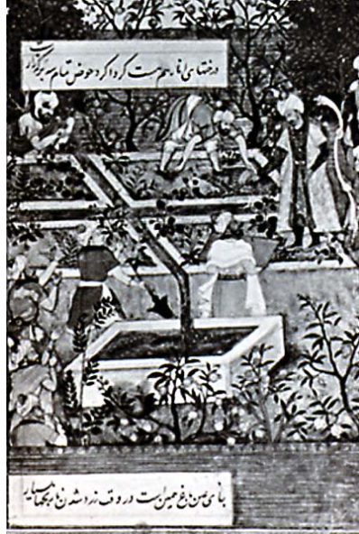
Emperor Baber supervising Garden of Felicity.